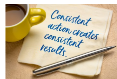
TOGETHER WE ARE CONSISTENT!