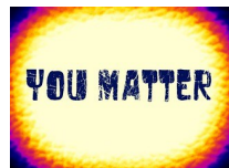
TOGETHER PEOPLE MATTER!