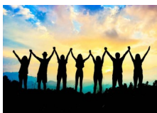
TOGETHER WE EMPOWER!

Federal law requires us to tell you how we collect, share, and protect your personal information. Our privacy policy has not changed and you may review our policy and practices with respect to your personal information at www.gratiotcu.org or we will mail you a free copy upon request if you call us at 989-463-8321.