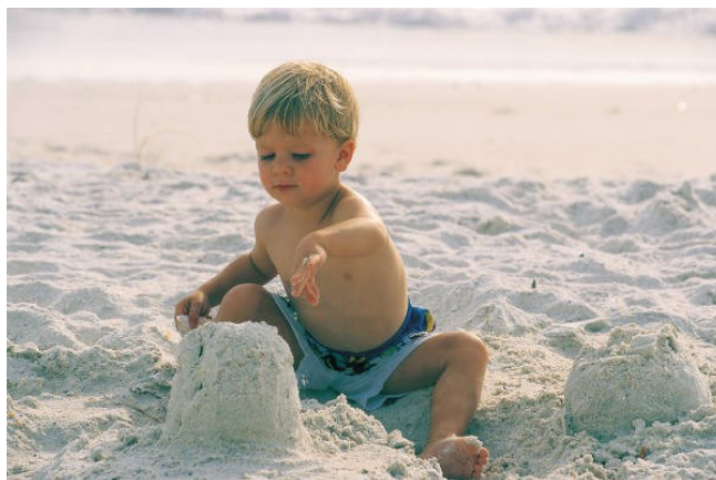
Vacation Clubs pay out June 1st, 2024. With an interest rate of 2.50% APY, don't delay, open one today.

"Add Account", verify your info and then click "Select Payment Method".